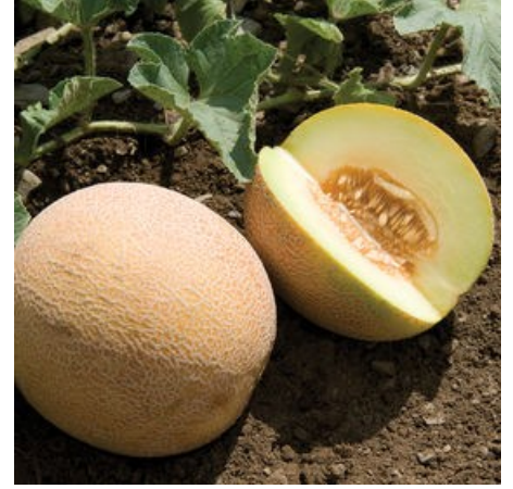
Ananas - Pineapple