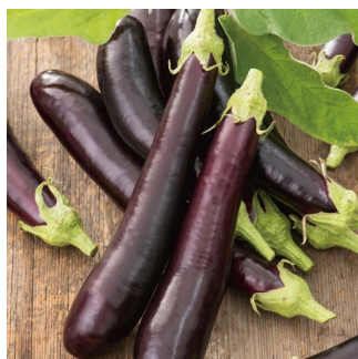
Long Italian - long & skinny