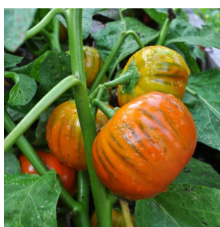
Turkish Orange, mini fruit