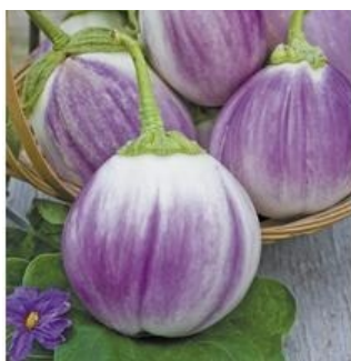
Rotonda Bianca, standard size