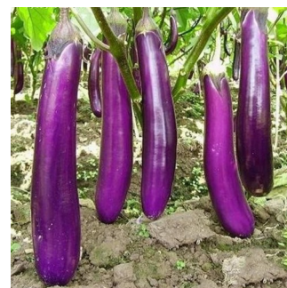
Farmers Long - long & skinny