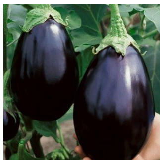
Black Beauty & Violetta di Firenze, standard size