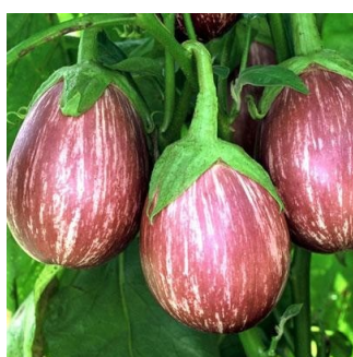
Listada di Gandia, standard size