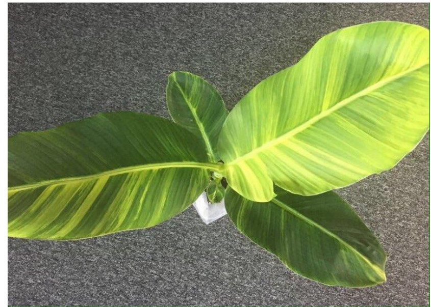
Musa Acuminata Colla Variegated