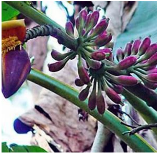
Musa itineranse 'Burmese Blue'