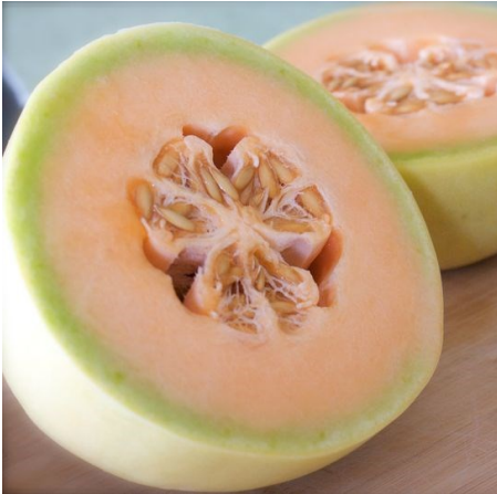
Temptation - Honeydew