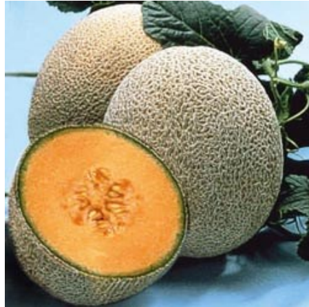
Eldorado Dolcissimo, Hales, Schoons Hard Shell, Retato Degli Ortolani - Cantaloup