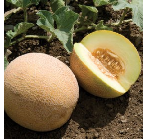
Ananas - Pineapple