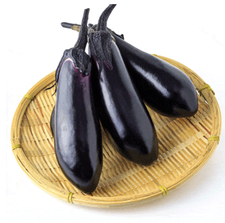
Japanese Millionaire, small fruit