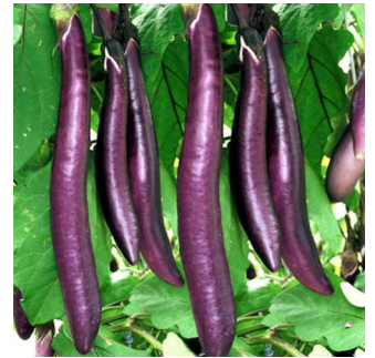
Long Italian & Fengyuan - long & skinny