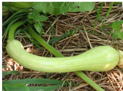
Extra long: Tromba D'Albenga & Serpente di Sicilia