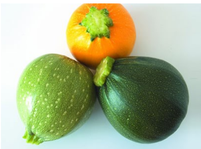
One Ball (yellow), Midas (yellow) & Tondo di Nizza (green)