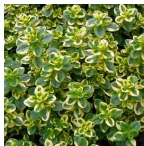
Golden Queen (L)