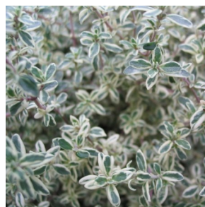
Silver Queen (L) & Silver Posie (L)