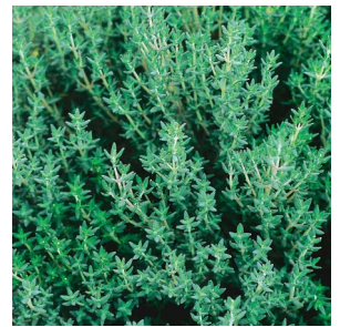
Common & Common Compact