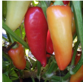
Santa Fe Grande