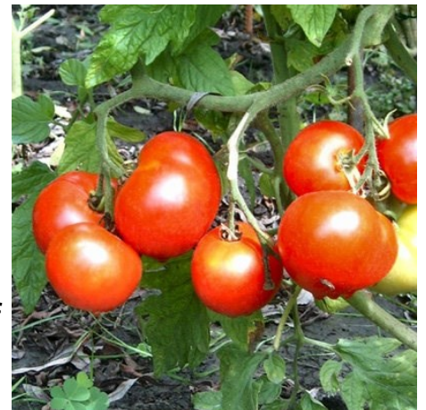
Aurora & Livingstone Dwarf, Big Dwarf regular size tomaoes

Yellow varieties: Ola Polka, Peardrop (mini pear), Yellow Pygmy