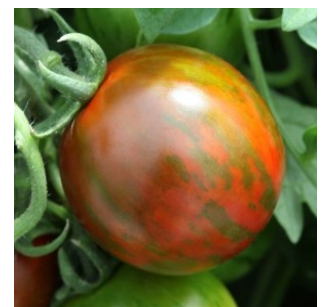
Rambling Red Stripe