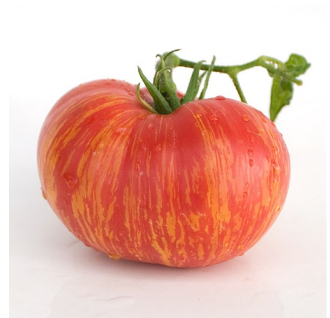
Dwarf Beauty King

Red varieties: Baby Boomer, Bajaja Gartenperle, Koralik, Maskotka Red Alert, Tiny Tim & Window Box Red