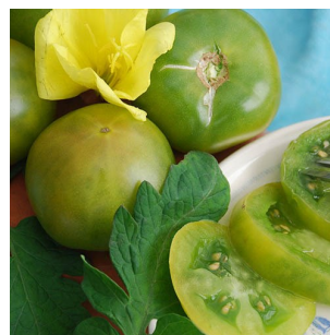
Dwarf Beryl Beauty