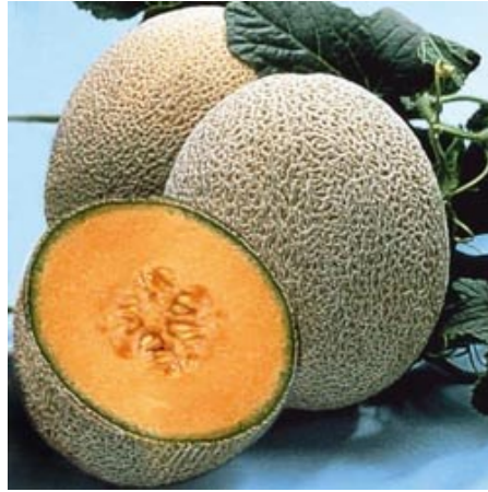
Eldorado Dolcissimo, Hales, Schoons Hard Shell & Robins - Cantaloup