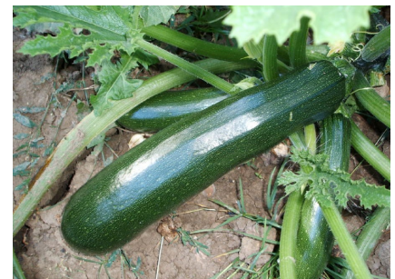
Standard green: Black Beauty, Green Bush & Verde di Milano