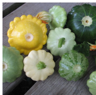
Patty Pans: green and yellow