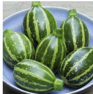
Piccolo: round & striped