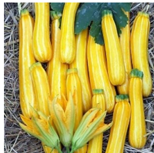
Yellow striped: Sunstripe