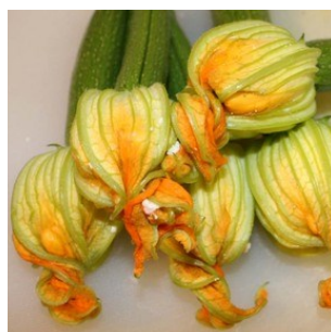
Courgette flowers: Da Fiore