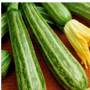
Green Striped: Striato D'Italia & Romanesco