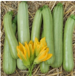
Light Green: Bianca di Trieste