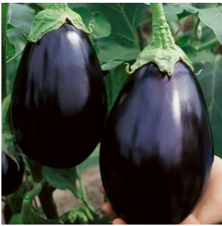
Black Beauty, standard size