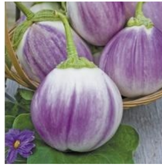
Rotonda Bianca, standard size