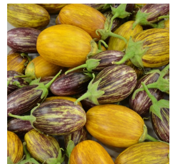
Udumalapet, small, ripens yellow