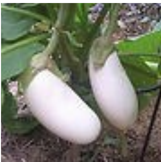
Casper, standard size