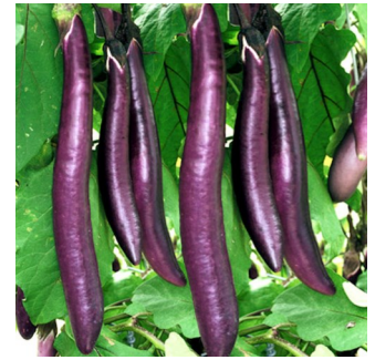
Japanese Millionaire, Long Italian, & Fengyuan - long & skinny