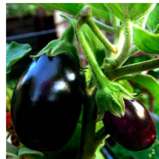
Baby Belle, mini fruit