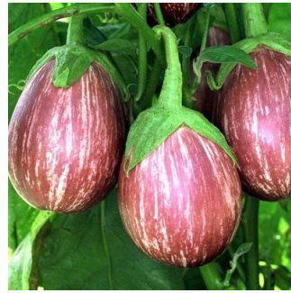
Listada di Gandia, standard size