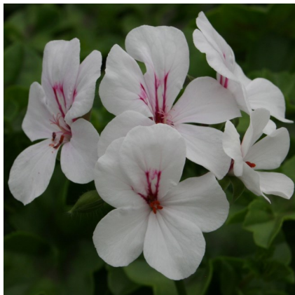
Happy Face White