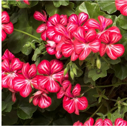
Happy Face Dark Red Mex