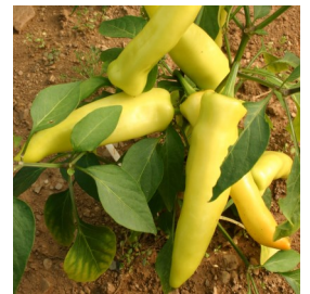
Hungarian Yellow Wax