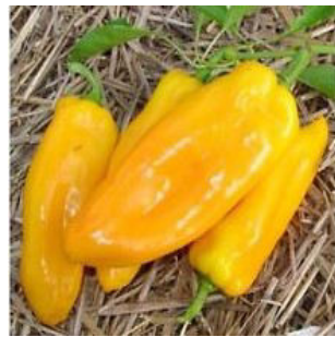
Marconi Golden, Corno di Toro Yellow