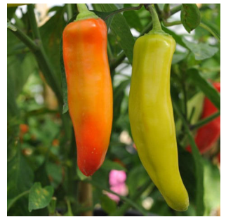
Hungarian Sweet Wax