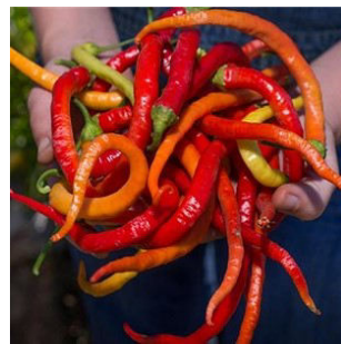
Corbaci (Turkish heirloom)