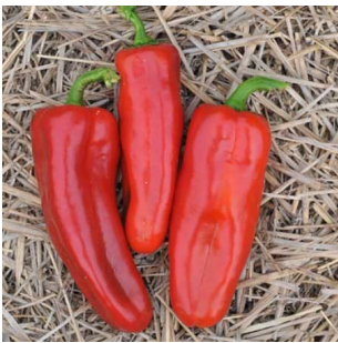
Marconi Red, Dulce de Espana, Tolli's Italian, Semorah

The plants will generally be about the same size, upto 2ft wide, 3ft high. Peppers come in all sizes and shapes, and they generally start off green and ripen to their final colours as the season progresses. This page shows the 'bullhorn' and pointed varieties that are becoming more widely available in supermarkets, but at premium prices. They can be used just the same as any regular bell pepper, but are particularly suited to stuffing.