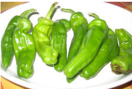
Friggitello - like a padron, but without any heat