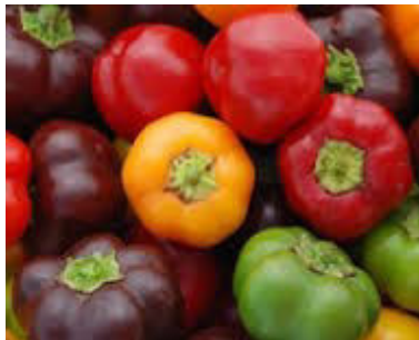
Mini Bell series, grows 1-2 inches across