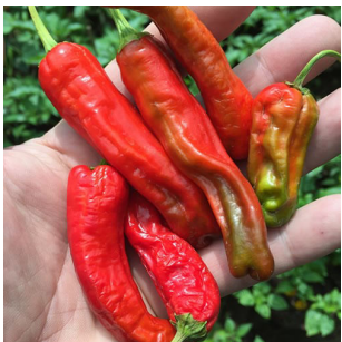
Golden Greek Pepperoncini